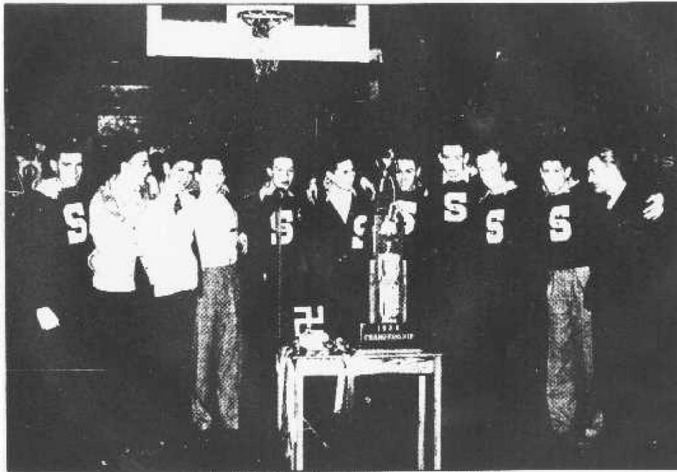
Archers Awarded Official Welcome By Students At School Gymnasium.

Triumphant Heroes Acclaimed, Hailed With Parade